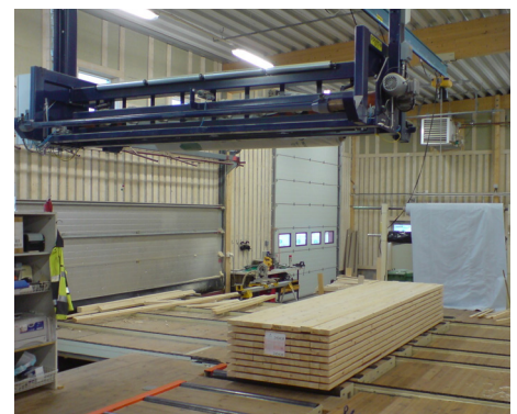
Ceiling mounted version