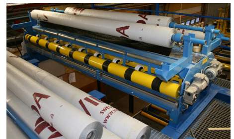
Rooftop twin version (Double set of roller holders)